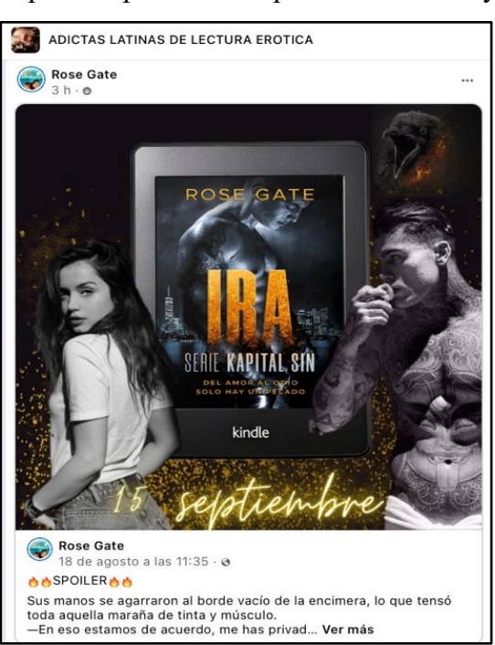
Figure 3. Example of a promotional poster for a literary work

Note. Figure 3 shows an example of a poster published by Rosa Gate to promote her novel Ira in the group Latina Addicts to Erotic Reading .