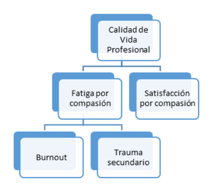
Figura 1. Modelo de Calidad de Vida Profesional.

which refers to a negative feeling caused by the relationship of help and empathy towards people who have suffered trauma (See figure 1).